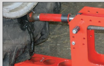
Breaking the outer bead

Protected by UK patents GB2400587A & GB2417013A.