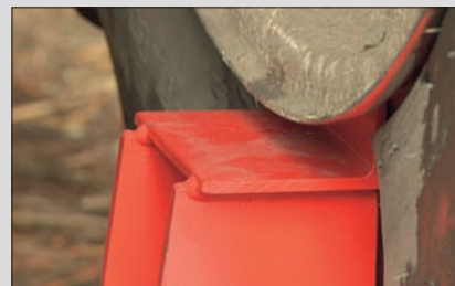
Breaking the inner bead

Simple steps to breaking inner and outer beads